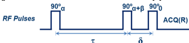
Fig.1 TQTPPI pulse sequence. Increment \tau = ns \cdot \Delta , \alpha = ns \cdot 45^\circ , \beta = \pm 90^\circ , R = 0^\circ , ns = 760 .

The TQTPPI spectrum ( Fig. 2 ) reveal sodium bound to tumor cells. The TQ peak has a frequency exactly three times more than the single quantum peak (SQ) frequency. The SQ peak represents the total sodium signal from the media and cells, while the TQ signal represents sodium interacting with tumor cells. This signal is capable to detect changes of intracellular sodium in tumor cells [2].